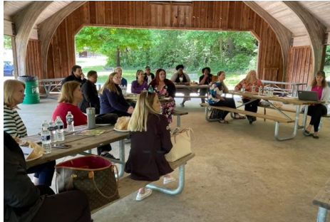
HEAL Work Group Retreat May 18, Kinder Farm Park